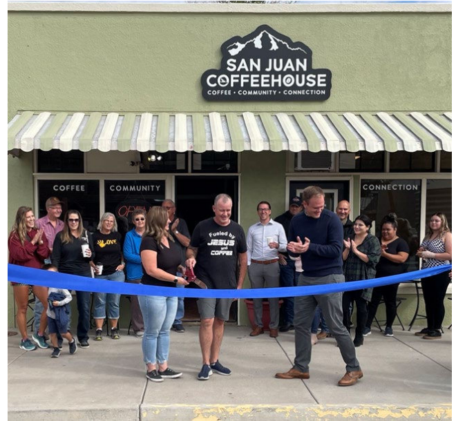
Region 10 | The Business Cultivator hosted a ribbon cutting for the opening of San Juan Brews in Olathe on Fri, Sept 15.