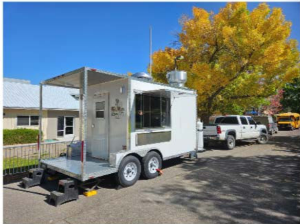
(Above) The commissary kitchen will be stationed at the Region 10 Business Cultivator in Clarke. (Right) Inside the food trailer.

Region 10 serves six counties in western Colorado — Delta, Montrose, Hinsdale, Garfield, Dukes, and San Miguel — providing small business services, mentor